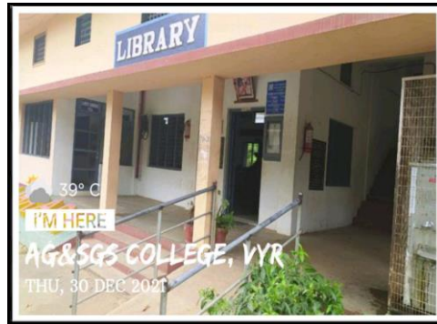
Ramp near Library