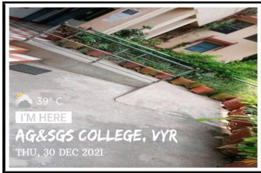
Ramp near Office room

The college offers ramp facilities for individuals with disabilities, ensuring easy access to various areas within the campus. Ramps are provided at the entrances of the Main Block and Library Building. These ramps feature a reduced incline, enhancing the ease and safety of wheelchair movement. They are thoughtfully designed to meet the specific requirements of disabled individuals.